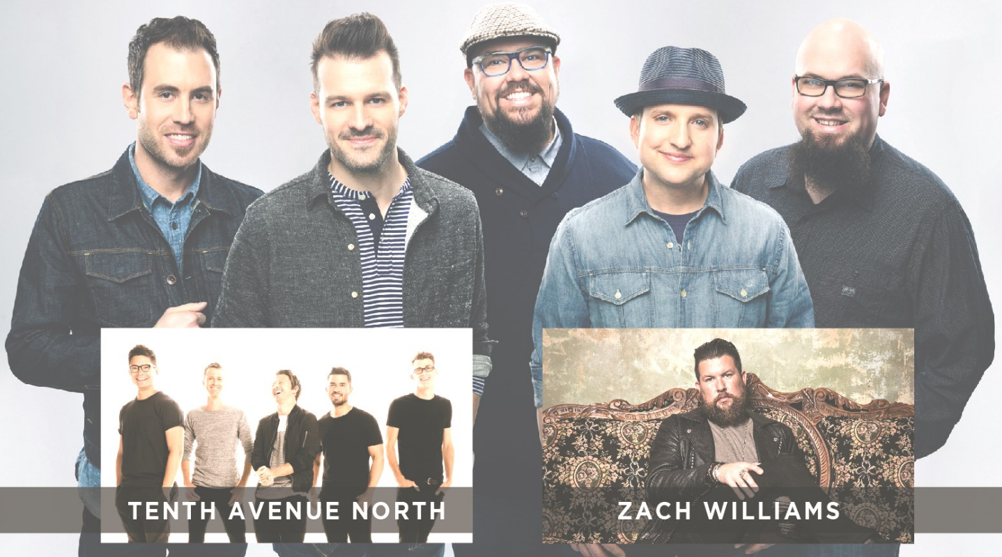
TENTH AVENUE NORTH