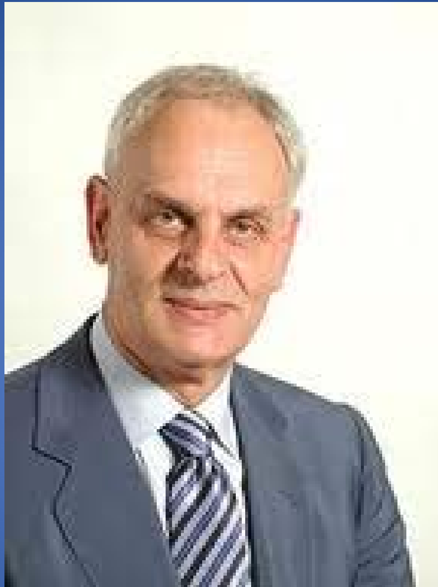
Marcello Pera, Leading European Scientist, Intellectual, and Atheist