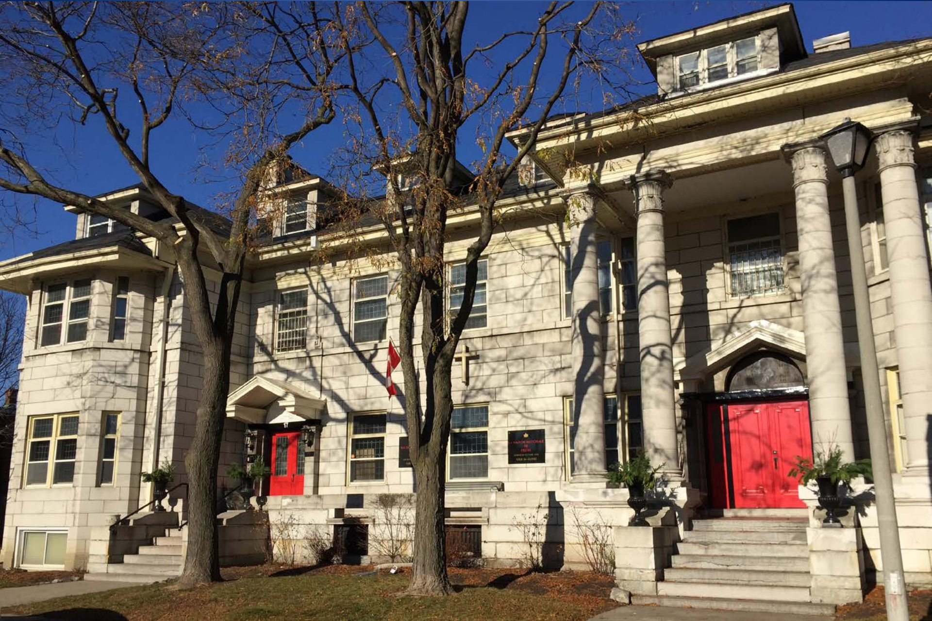
Nhop Building, Purchased 2005